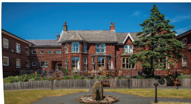
Starr Hills, Lytham St Annes, Lancashire

The location is within a conservation area, which ensures both quiet surroundings and a relaxed pace of life. Lytham St Annes is a traditional seaside town with a Victorian pier and the famous Lytham Green and Windmill. The area is also renowned for Ribble Estuary, home to over 250,000 migratory birds every year and the RSPB Discovery Centre at Fairhaven Lake.