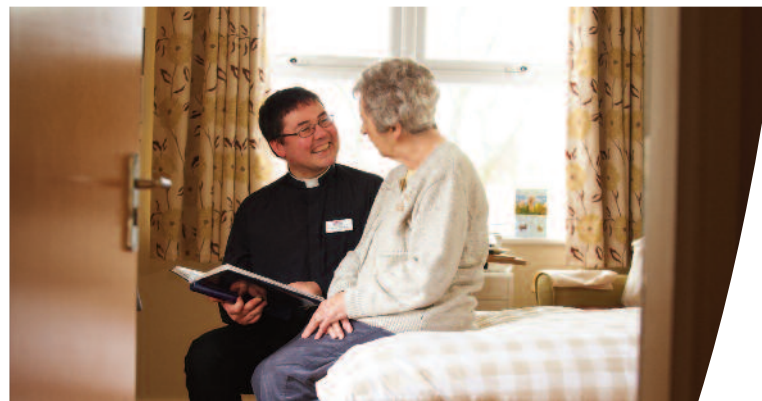
Resident and Chaplain chatting

As part of MHA's desire to offer the very best in later life, we also provide additional therapies such as reflexology for your well-being. These gentle one-to-one sessions aim to bring calm and relaxation.