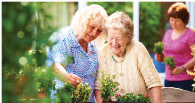
Resident and Care Assistant help to make the garden grow

We take pride in the cleanliness and maintenance of your home and provide a thorough and friendly cleaning service. Your personal washing will be carefully laundered and returned to you, clean and fresh.